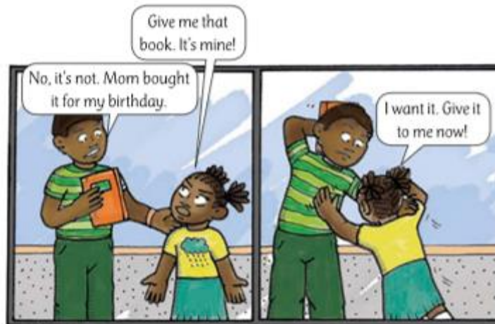
A potentially violent situation at home

8. Study the cartoons below and then answer the question which follows.